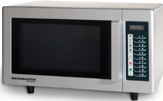
Model RMS510T/RMS510TS shown